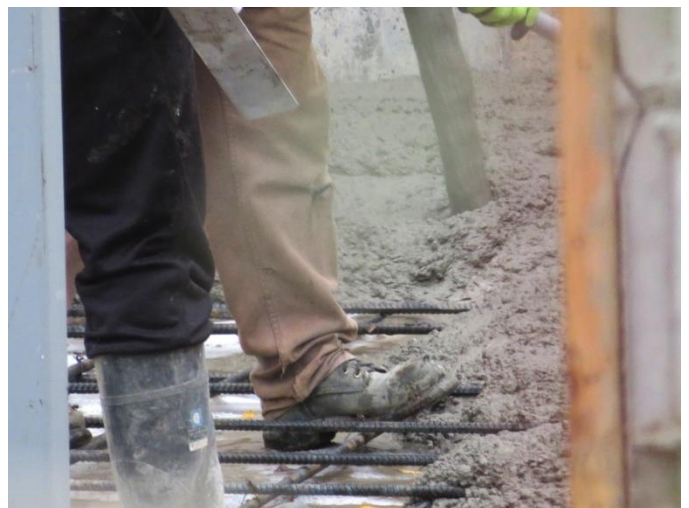
Basement floor concrete being poured