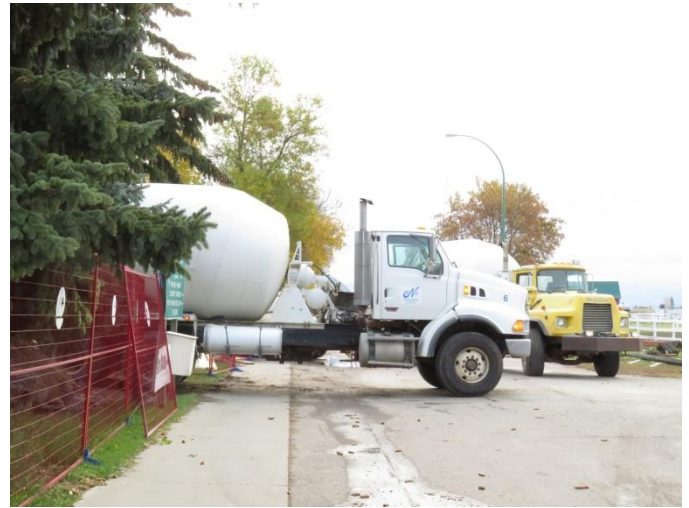
Pumper Truck Controller on the job