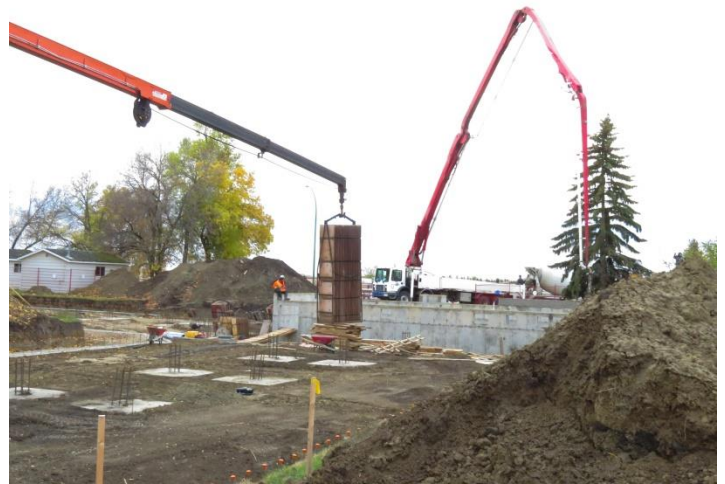
Forms being delivered and unloaded for North and East Wing foundation walls.