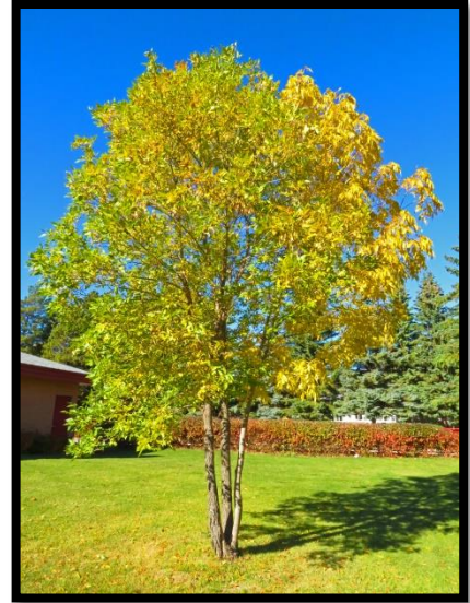
Beautiful Fall Day!