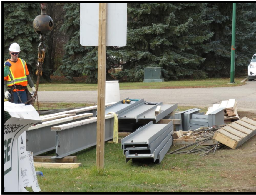
Just the large floor joist to hoist yet—be careful!