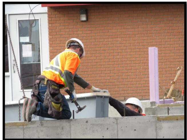
Will it fit, yes, perfectly!