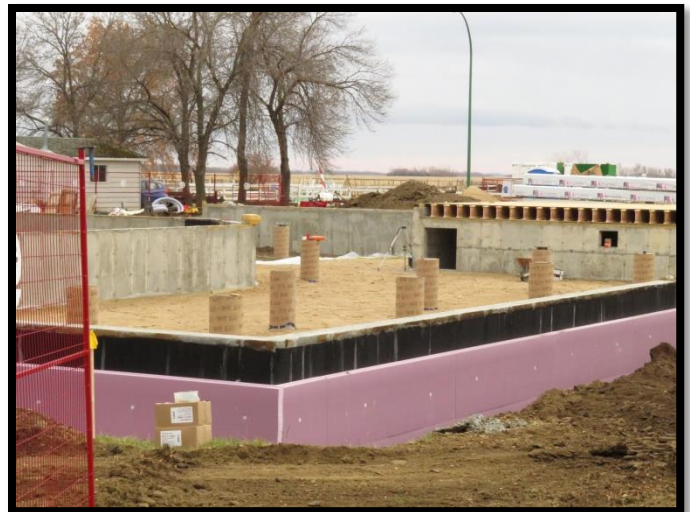
Gravel put in the crawl space and fill dirt around the foundation put in.