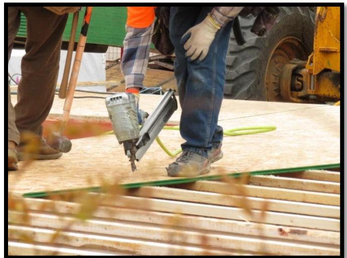
Working on the Chapel floor.