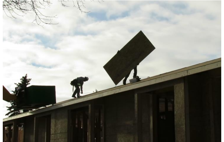
With the sheathing lifted up into place the task at hand moves forward.