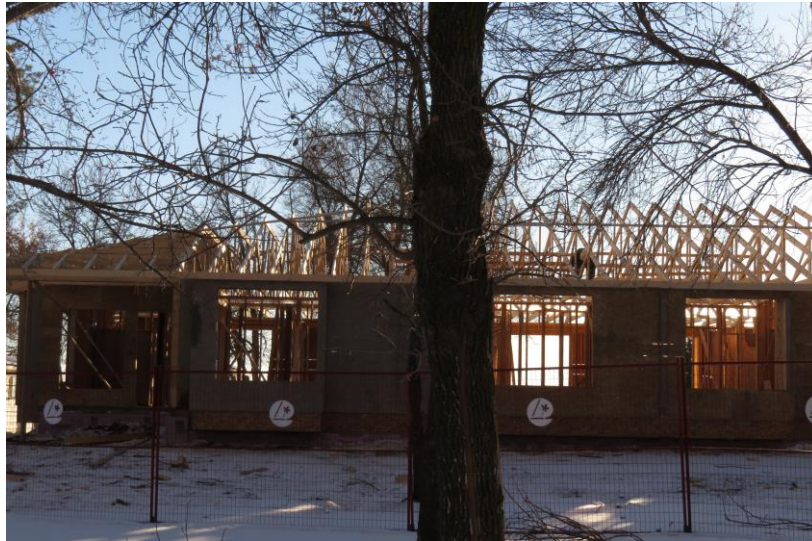
By December 11 trusses on East Wing are in place.