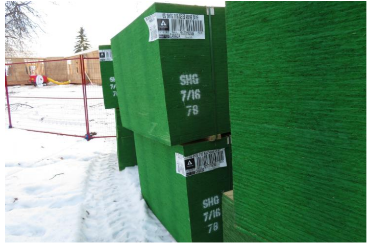
The arrival and unloading of the sheathing for the next big job!!