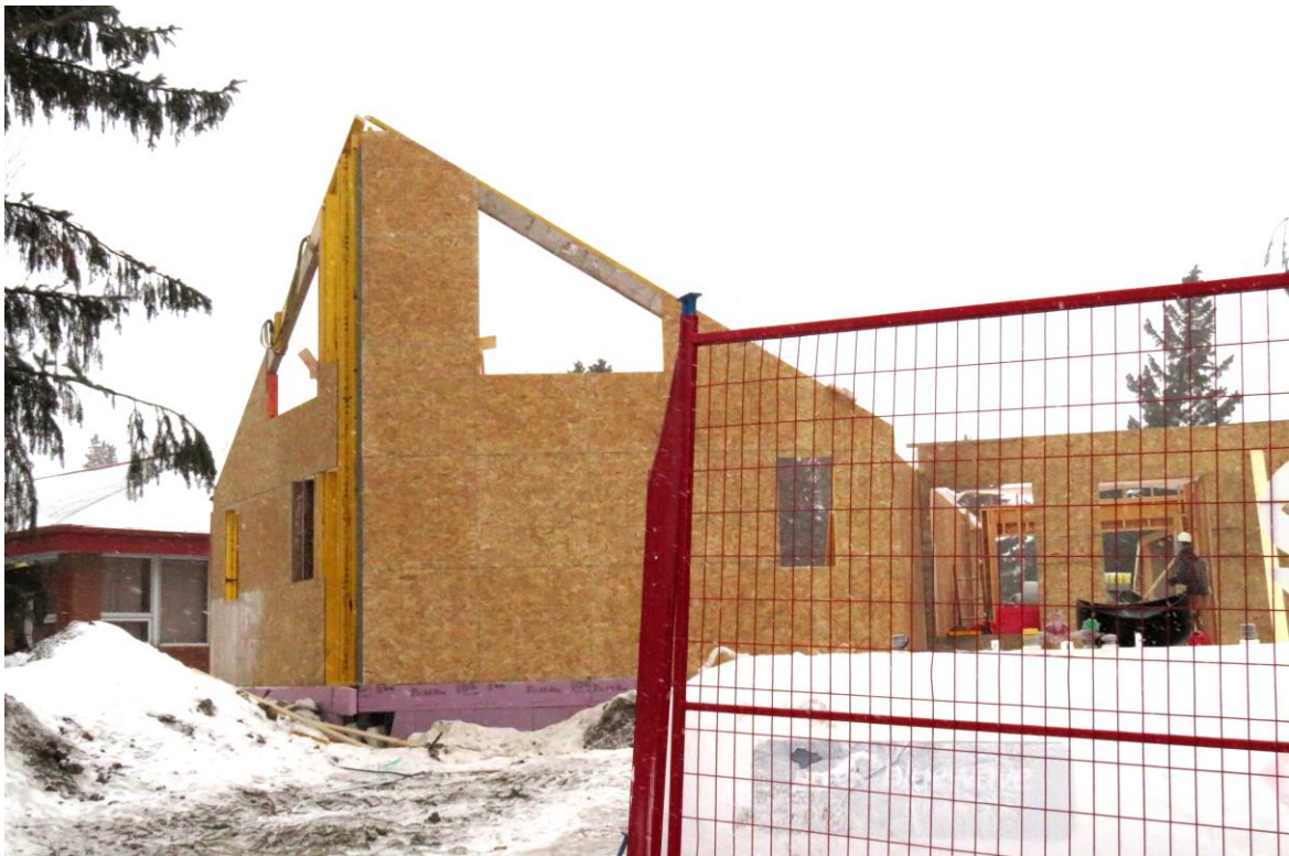
The Chapel is beginning to take shape.