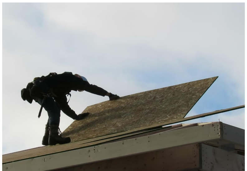
Piece by piece they are carefully fitted.