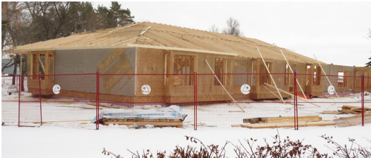
By December 12 most all of the North Wing trusses are in place!