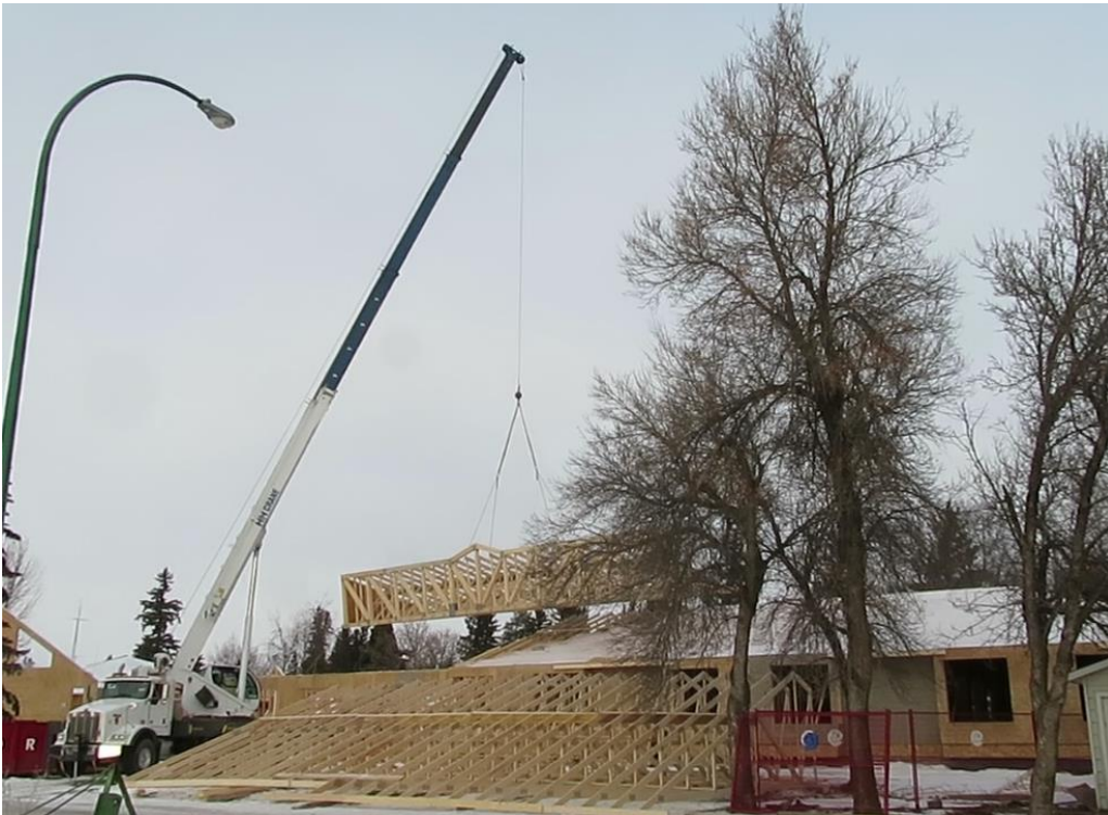
There goes section #1