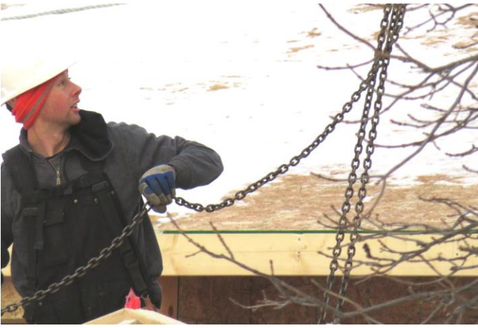
Getting all the chains correctly positioned!