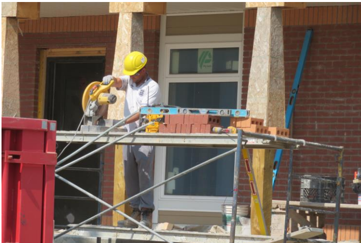
Work being on the front pillars