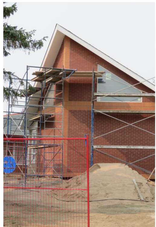
Brickwork on Chapel done