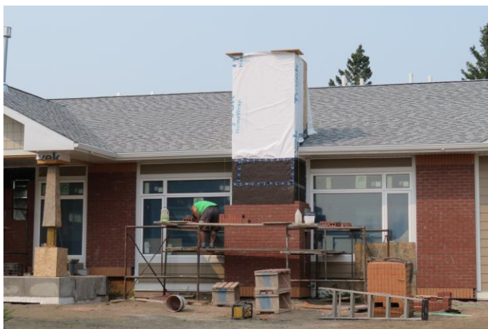
Working on the chimney on south side of the building near the entrance.