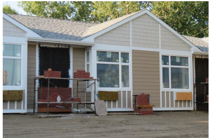
Bricks getting to their destination!