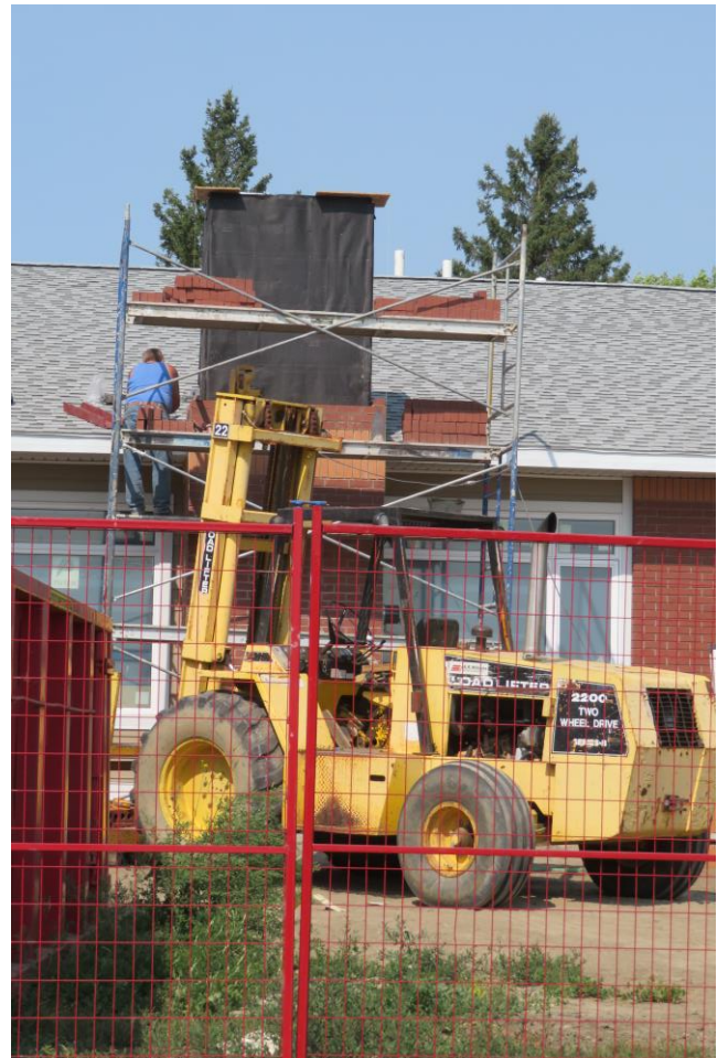
Chimney work continues.