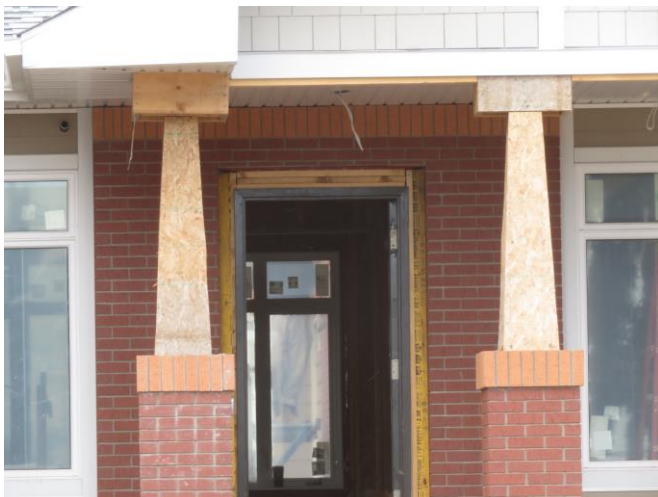
Brickwork done on front pillars