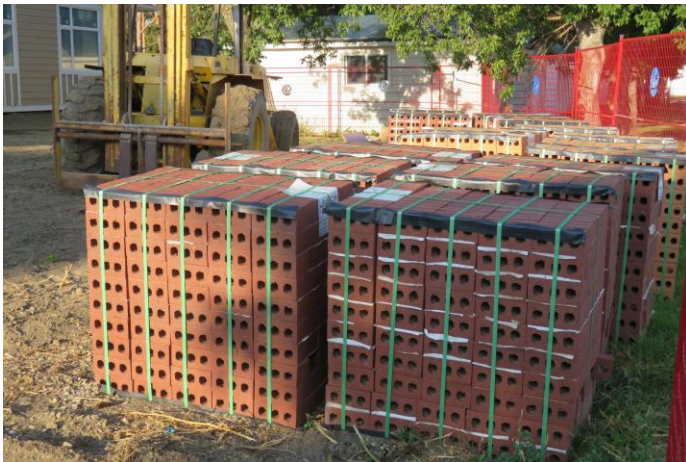
Pallets of bricks waiting their turn!