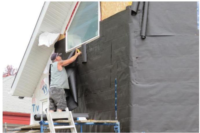
Chapel prep work