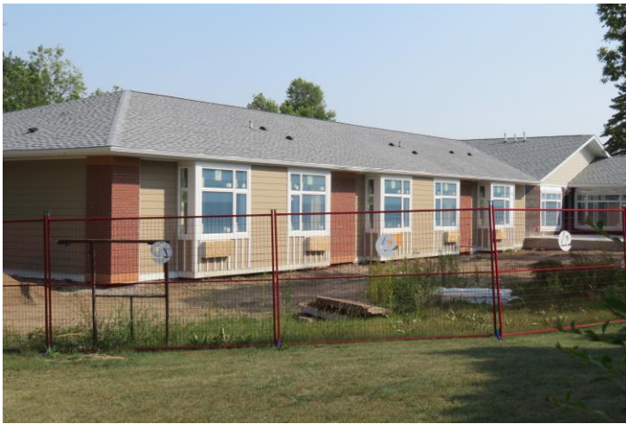
West side of the North Wing