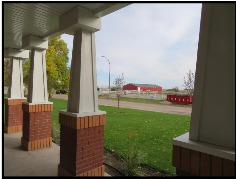
A View from the Veranda looking south

Come to the Open House and Grand Opening to see everything in person