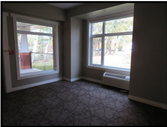
Sitting Room at the end of the hall