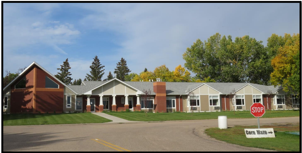
This is Sunrise Place , done on the outside, but needs more final touches inside.