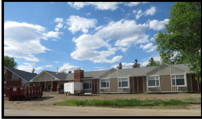
The “construction fence” is gone!

We're back outside. The following will exhibit pictorial changes of the leveling the land around the Centre, finishing front pillars, installing underground sprinklers, working on backyard fence, landscaping by planting trees, ornamental grasses, and sod laying.