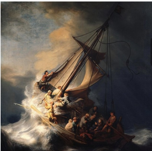
Painting by Rembrandt titled "Christ In The Storm" 1633

In Mark 4:39 we read of the time when Jesus was on the Sea of Galilee with His disciples. It was a casual sail across the lake in their wooden fishing boat. Just for fun! Suddenly a huge storm arose causing great danger for anyone on the lake. The disciples on board were terrified thinking their boat would capsize and they would all drown. The story ends with Jesus stretching out His arms telling the wind to be still.